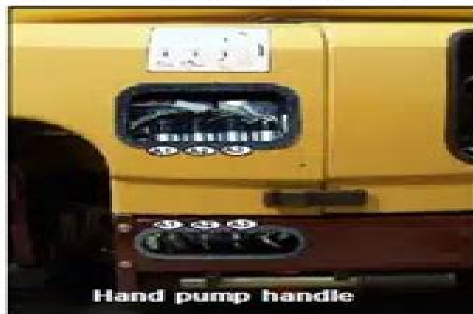
Fig. 4.4 - Breakdown control panel.

Depress the emergency stop switch on the lower control panel. Insert the hand pump handle in the hand pump (fig.4.5.). Activate the handle vertically while activating the manual control push button corresponding to the desired movement.