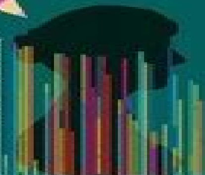
AUSTEN VS. BRONTË