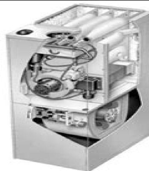
G26 FURNACE ▲ ◀ G26 HEAT EXCHANGE ASSEMBLY

Information contained in this manual is intended for use by qualified service technicians only. All specifications are subject to change. Procedures outlined in this manual are presented as a recommendation only and do not supersede or replace local or state codes. In the absence of local or state codes, the guidelines and procedures outlined in this manual (except where noted) are recommended only.