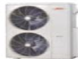
MLB and MPC Multi-Zone