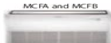
MCFR and MCFB

Please refer to service manual 100030 for indoor and outdoor unit error codes and component diagnostics.