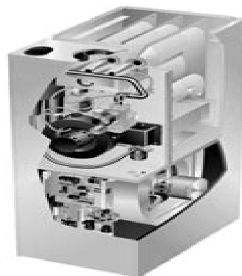
G32V FURNACE ▲ ◀ G32V HEAT EXCHANGE ASSEMBLY

Information contained in this manual is intended for use by qualified service technicians only. All specifications are subject to change. Procedures outlined in this manual are presented as a recommendation only and do not supersede or replace local or state codes. In the absence of local or state codes, the guidelines and procedures outlined in this manual (except where noted) are recommended only.