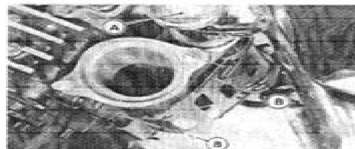
A. Engine Mounting Bolt and Nut B. Cap Nuts