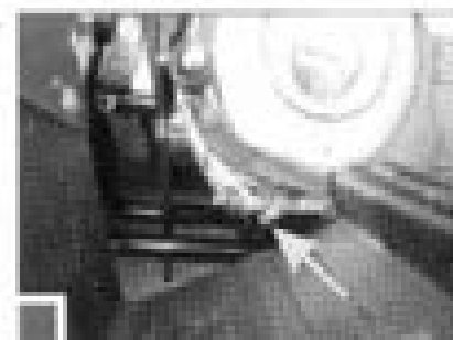
OIL DRAIN OUT SCREW