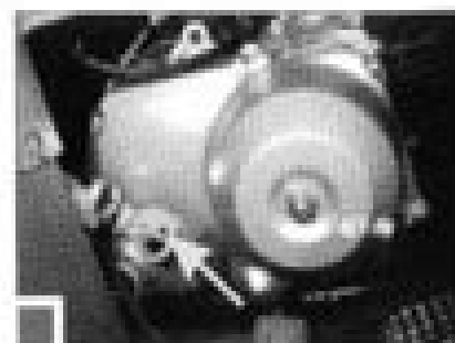
ENGINE OIL DIPSTICK