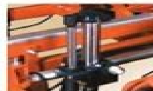
Hydraulic Log Clamp