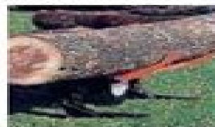
Hydraulic Loading Arms