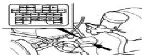
MX-5 - near brake master cylinder