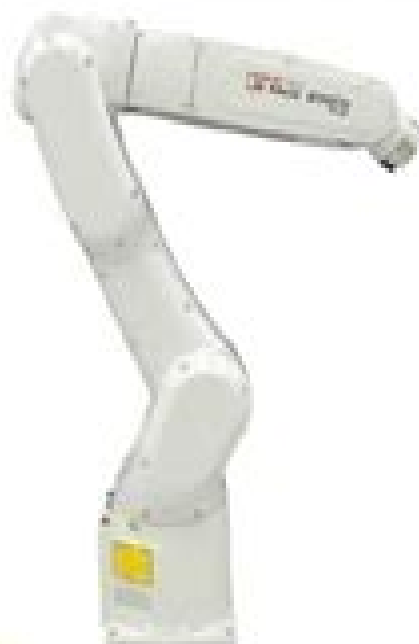
LR Mate (200)

Long arm, clean room, food grade grease (2 integrated solenoid valves)