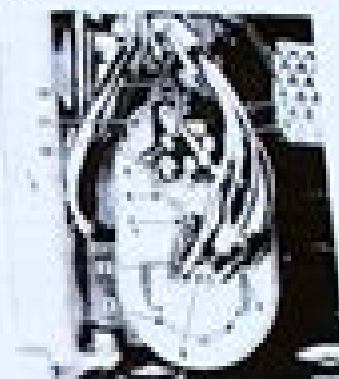
Fig. 42 Part of instrument panel showing light switch, battery switch, cables, etc.

Tractor light requires 6-8 volts, 10-wattage or single contact type lamps (No. 144700—Trade No. 11411).