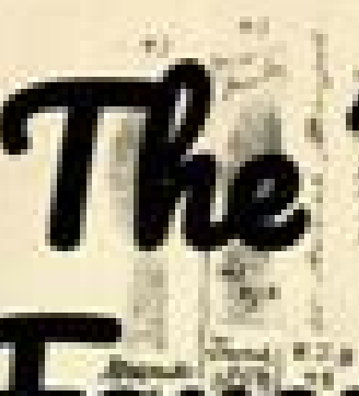
An early specimen of finger-printing