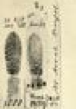
of your natural