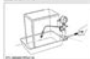
(2) Allowable limit