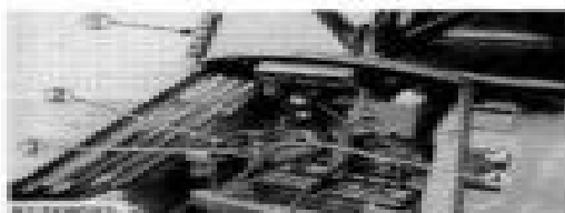
11460-11469 10/07, 11/14/0 (1) Grip (2) PTO Clutch Lever (3) ATA PTO Cable (4) PTO Clutch Wire