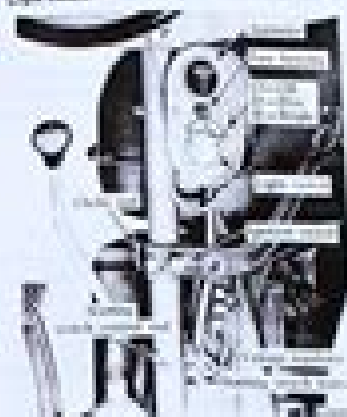
Fig. 41 Light switch, ignition switch, cables, etc.

The light switch has three positions: "O"—off position; "D"—dim light, and "B"—bright light.