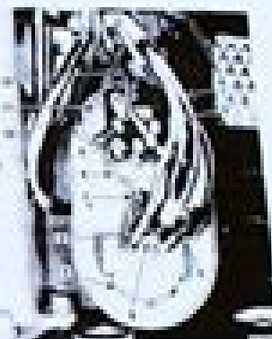
Fig. 42 Part of instrument panel showing light switch, light switch, battery cables, etc.

Tractor light requires 6-8 volts, 10-wattage or single contact type lamps (No. 144700—Trade No. 11411).