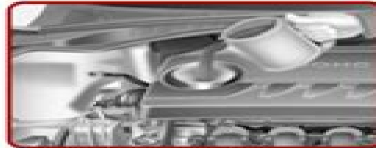
Refilling engine oil [8] Use only the specified engine oil [9] and avoid spillage.