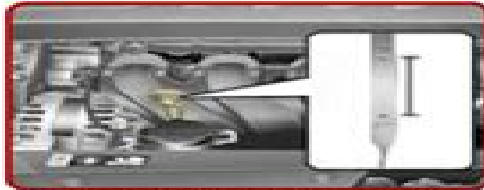
Checking the engine oil level [8] Pull the dipstick out and check the level. The level should be between F and L.