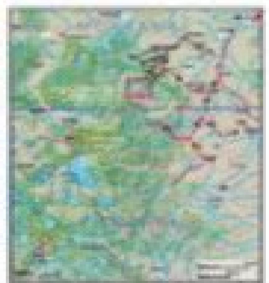
Granite Peak Topographic Map. Created by the National Geographic Society.

Granite Peak is a popular climbing destination for hikers and climbers alike. The mountain's rugged terrain and stunning views make it a must-visit for anyone looking for a challenge. The trail is well-maintained and offers a variety of routes for different skill levels. The peak is reached via a series of steep, rocky slopes that require some technical climbing skills. The summit offers a breathtaking view of the surrounding landscape, including the Snake River and the surrounding mountains.