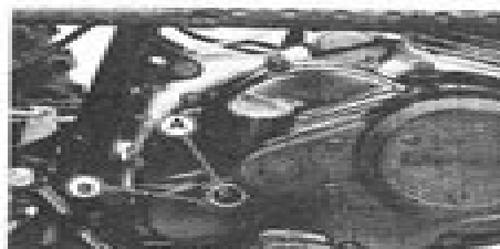
Oil level sight glass (A) and level marks (B)