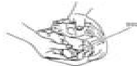
Fig. 67 Installing spring seat (602)