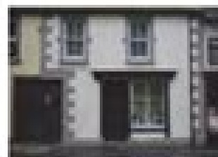
1.28 The 19th century also saw the development of purpose-built terraces and flats with decorative carvings at the upper floors. Chateaux or castle houses and villages, often an increasingly common and a risk of overpopulation elsewhere.

It was during this period that stone-built, suburban housing emerged for the first time, with some of developers led by iron and steel-structured