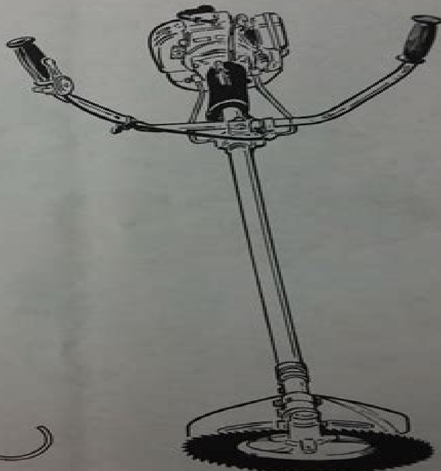
MODEL HK-33 BRUSHCUTTER UT-18002