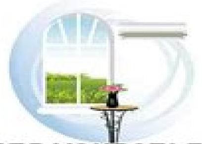
KEEP YOURSELF COOL