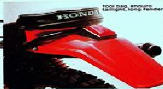
Tool bag, enduro taillight, long fender.