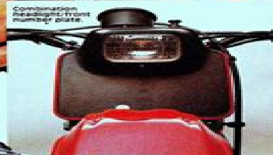
Combination headlight, front number plate.