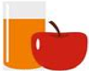
APPLE CIDER VINEGAR