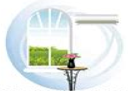
KEEP YOURSELF COOL