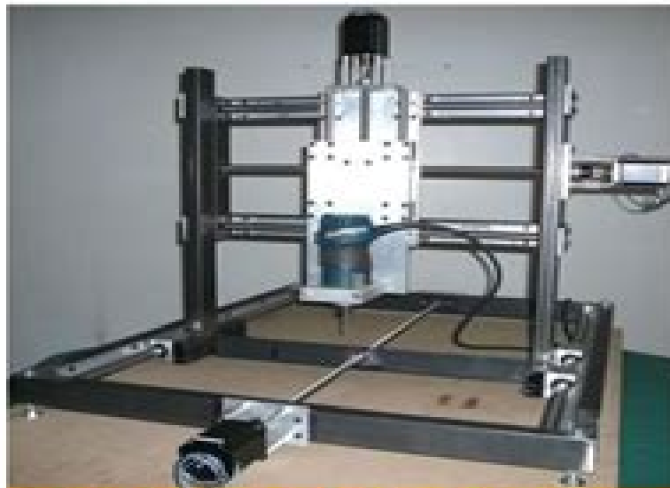
Build a CNC Router