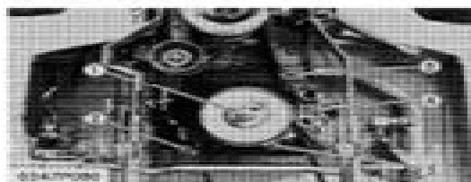
63477006 Disassembling Speed Variator