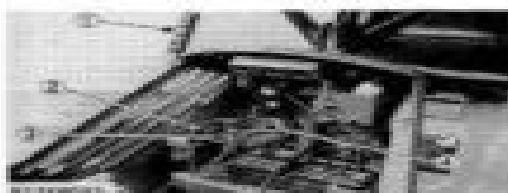
11460-11469 10/01 11/40 (1) Grip (2) PTO Clutch Lever (3) ATA PTO Cable (4) PTO Clutch Wire