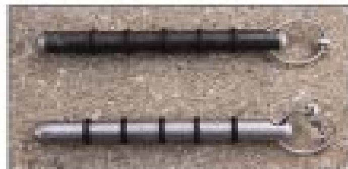
Personal Keyring Kubotan is the best Kubotan design.