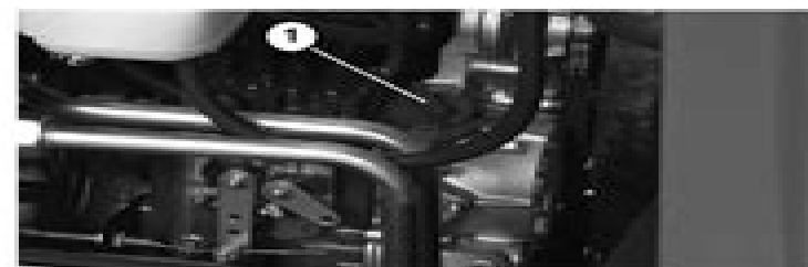
Figure 3 1. Filler Cap