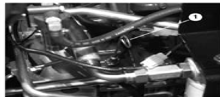
Figure 2 1. Dipstick