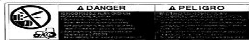
(5) Part No. K3611-4765-1