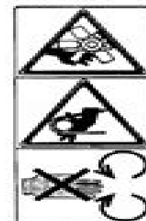
(4) Part No. TA040-4857-1 Stay clear of engine fan and fan belt.