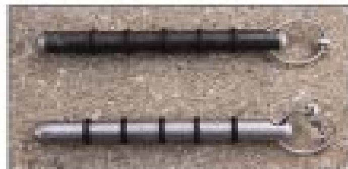
Personal Keyring Kubotan that looks innocuous.