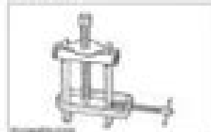
Fig. 2 Specialized Puller Set