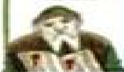
1859 Thomas Edison's light bulb