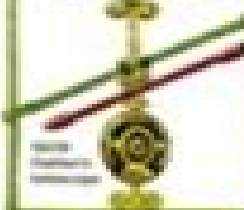
1769 James Watt's steam engine