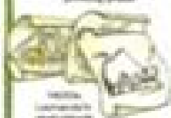
1866 Christopher Latham Sholes's typewriter