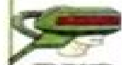
1875 Thomas Edison's light bulb