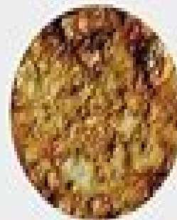
Decline in Product Quality