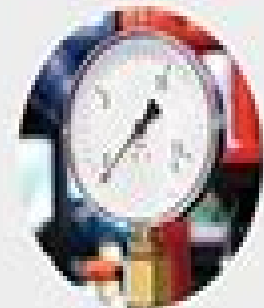
Unplanned Costly Repairs/Breakdown