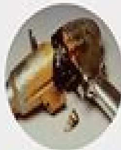
Rusting of Parts

Problems caused by poorly treated compressed air