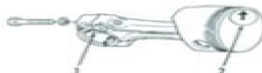
Fig. K109—Assemble piston to connecting rod so arrow mark (2) on piston crown is aligned with machined surface (1) on connecting rod and cap.