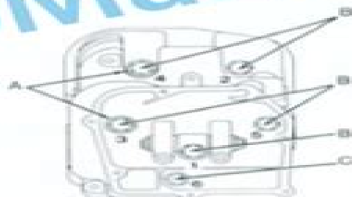
Fig. K107—When tightening cylinder head bolts, follow sequence shown. Refer to text.

Connecting rod small-end inside diameter should be 20.015-20.025 mm (0.7889-0.7884 in.) and wear limit is 20.07 mm (0.790 in.). Connecting rod big-end standard inside diameter should be 33.500-33.525 mm (1.3189-1.3199 in.). Crankpin standard inside diameter