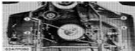
63477006 Disassembling Speed Variator