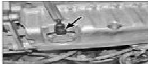
14.4 Disconnect the wiring connector from the oil level/temperature sender