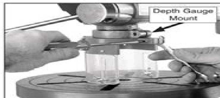
Figure 1. Example photo of installing chuck guard assembly.

Note: To prevent the guard from slipping off, move the table up to support it. Or, have an assistant hold the guard in place while you secure it.