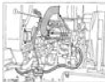
Fig. 20-10-3 (1) hose