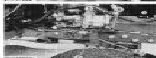
11461-11469 10/01 11/40 (1) HST Belt (2) HST Tension Spring (3) Engine Pulley (4) Tension Bracket (5) PTO Tension Spring (6) Return Spring (7) Tension Arm 1 (8) Tension Arm 2 (9) Tension Arm 3 (10) PTO Tension Arm (11) HST Tension Arm