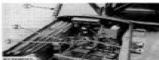
11460-11469 10/01 11/40 (1) Grip (2) ATA PTO Cable (3) PTO Clutch Lever (4) PTO Clutch Wire