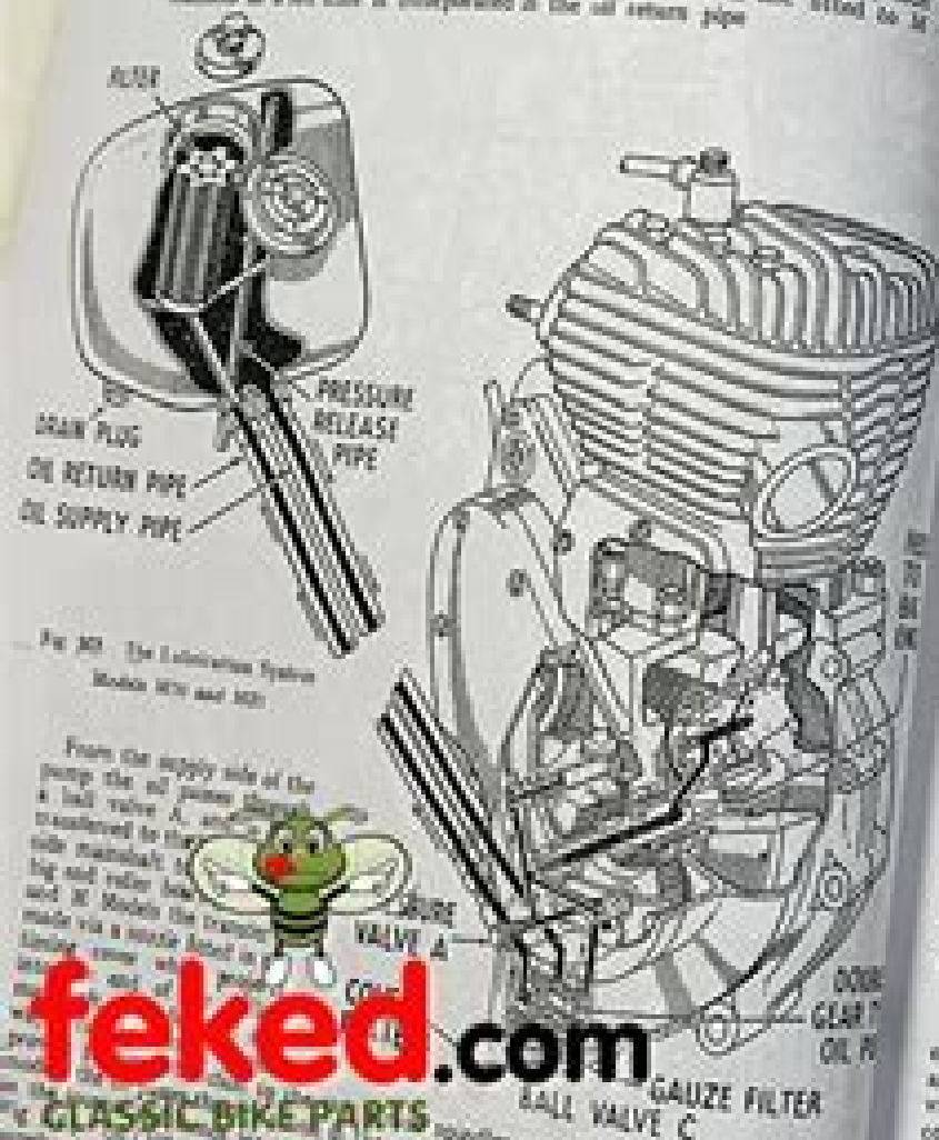
Fig. 302 The Lubrication System Models 1154 and 1155

The engine lubrication system is of the dry sump type operated by a double pump, situated in the bottom of the crankcase on the right-hand side. The pump draws the supply and return pipes to the tank and the rocker feed and drain pipes in the B Group. The oil drawn from the oil tank to the supply side of the pump first passes through a close mesh filter. This filter is not fitted to M Group machines as a jet filter is incorporated in the oil return pipe.