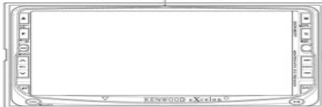
Note shown in DDX8017

Panel Assy (A64-2576-01): DDX8017, (A64-2576-01): DDX8037 (A64-2577-01): DDX8027/8027Y (A64-2578-01): DDX8047, (A64-2580-01): DDX8067