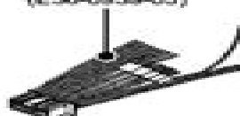
DC cord (E30-6940-05)