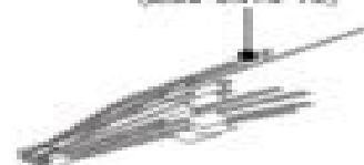
* ESOUTCHEON (B07-xxxx-xx)