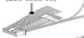
* DC cord (E30-6940-05)