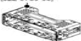
* DC cord (E30-6939-05)