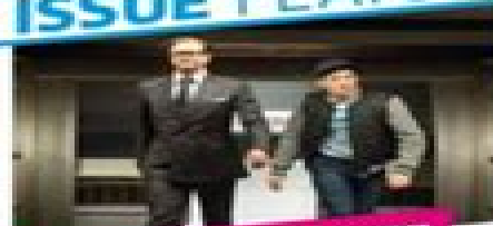
KINGSMAN: THE SECRET SERVICE