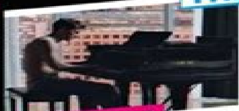
FIFTY SHADES OF GREY