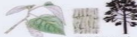
Black Cottonwood Populus trichocarpa D 1"-3"; H 60"-120" LV 3"-6"; R 0"-9000"