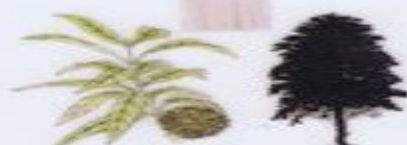
Golden (Giant) Chinquapin Castanopsis chrysophylla D 1"-3"; H 60"-100" LV 2"-5" L x 1.5" W; R 1"-6000"