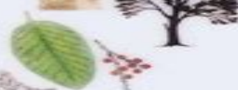
Pacific Madrone Arbutus menziesii D 1.5"; H 60" LV 2"-6" L x 1"-2.5" W; R 0"-5000"