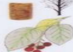
Common Chokecherry Prunus virginiana D 6"; H 20" LV 1"-3" L x 0.5"-1.5" W; R 0"-8000"