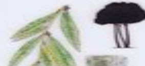
Pacific Waxmyrtle Myrica californica D 1"; H 30" LV 2"-4" L x 0.75" W; R 0"-500