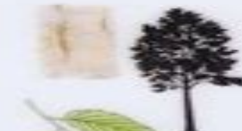
White Alder Alnus rhombifolia D 2"; H 60" LV 2"-3.5" L x 1.5"-2" W; R 0"-5000"