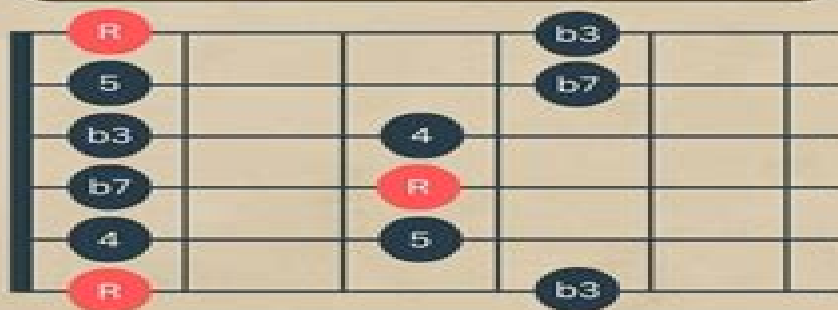
Shape 1 - Root Position