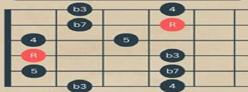
Shape 2 - b3 Position