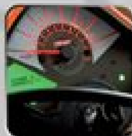
Tablero analógico digital