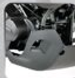
Protector de motor