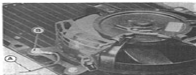
A. Ground Wire